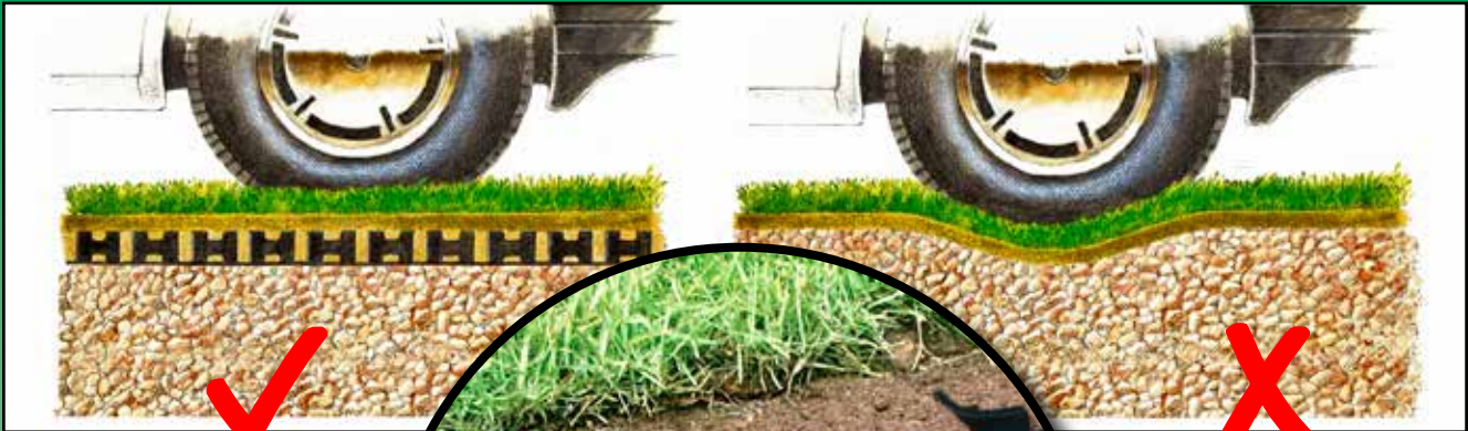
Stable GrassGrid Surface

GrassGrid provides designers and developers with a grassed alternative to concrete and asphalt surfaces that is practical, aesthetically pleasing and environmentally friendly.