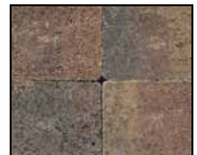
La Jolla* Blend

While the colors shown here are represented as accurately as possible, they should only be used as a guide. Actual samples should be viewed before making a final color selection.