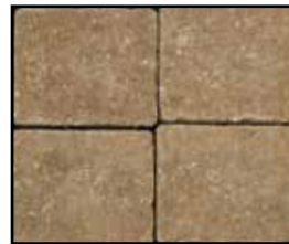
Desert Sand* Blend