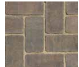
La Jolla Estate Stone* Blend with Tan colored sand