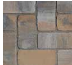
Copper Canyon Estate Stone * Blend with Pacific Grey colored sand

With Estate Stone, you can use different colors of Polymeric Sand to complement and personalize your project.