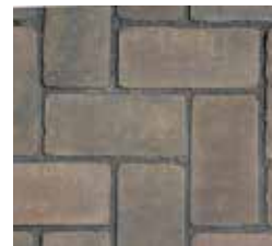
La Jolla Estate Stone* Blend with Black colored sand