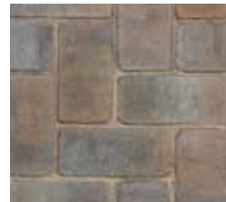
Copper Canyon Estate Stone * Blend with Tan colored sand