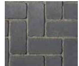
Charcoal Estate Stone with Pacific Grey colored sand