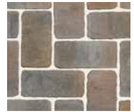
Copper Canyon Estate Stone * Blend with Ivory colored sand