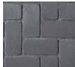
Charcoal Estate Stone with Black colored sand