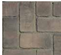
La Jolla Estate Stone* Blend with Pacific Grey colored sand