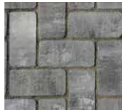
Granite Estate Stone* Blend with Pacific Grey colored sand