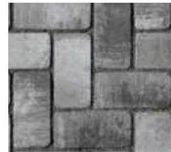
Granite Estate Stone* Blend with Black colored sand