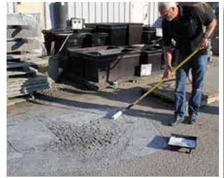
Roll on acrylic adhesive primer*