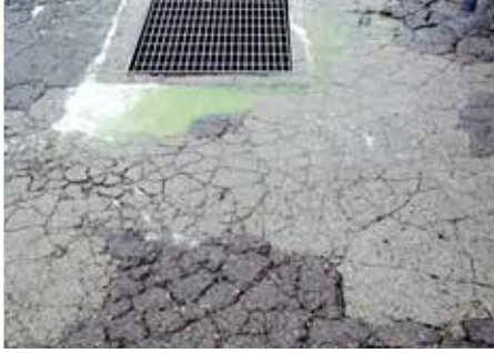
A typical "alligator skin" asphalt failure.