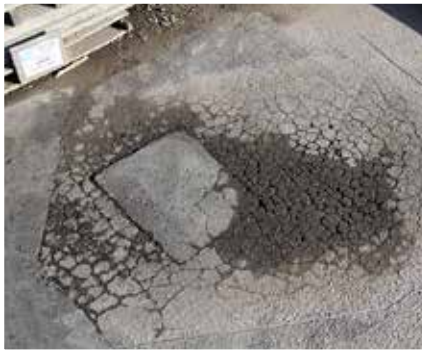
A typical "alligator skin" asphalt failure

Asphalt Repair Overlay – Vancouver, BC Elephant Armor® can be applied directly over broken asphalt surfaces.