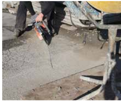
Saw cut a groove around repair to create a hard edge