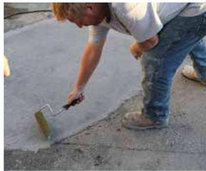
Roll surface with a texture roller to mimic asphalt appearance