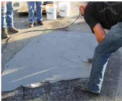
Place Elephant Armor®, folding product into precut groove