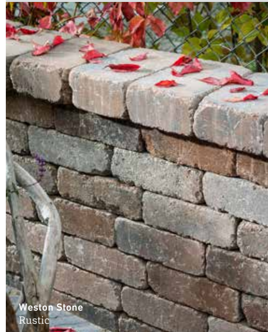
Weston Stone Rustic